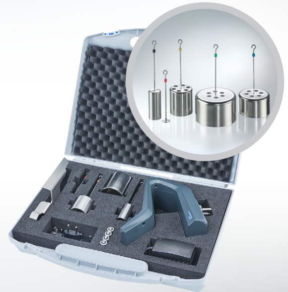
Color-coded rotors with "Select Assist" functionality